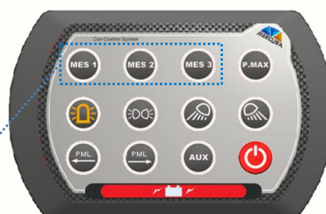
Standard Control Panel