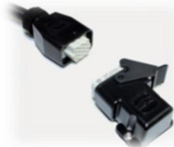
Roof Connector option - 32709