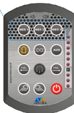
Control Panel with Public Address function, supplied with option 32710