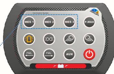
Standard Control Panel