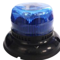
ISO XS base